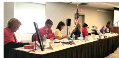
The GFWC Wisconsin State Officers hard at work at Winter Workshop.