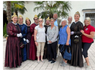
GFWC Woman’s Club of Pewaukee Wisconsin meeting with the Goldhaubenfrauen this past summer in Austria.