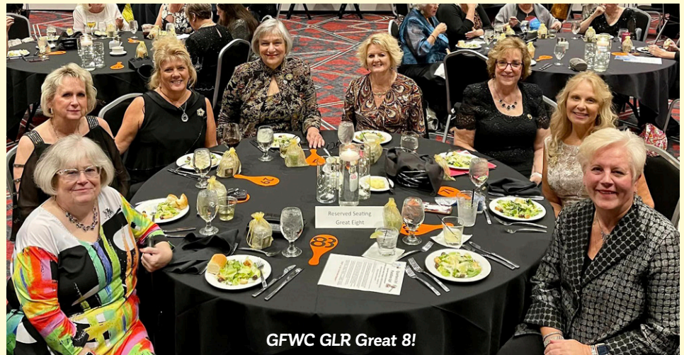
GFWC GLR Great 8!