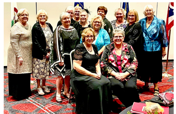
GFWC Indiana delegation at the GLR Conference