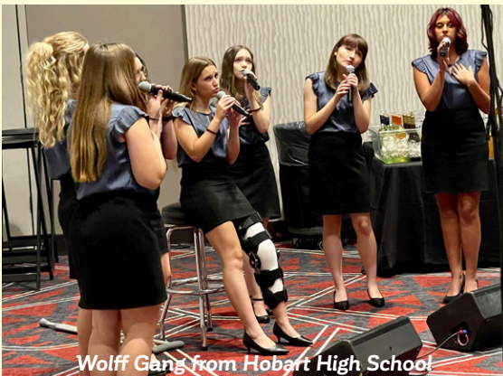
Wolff Gang from Hobart High School!