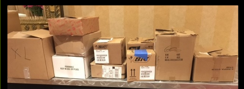
Leftover boxes sent to Springfield