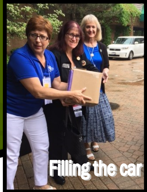
Filling the car