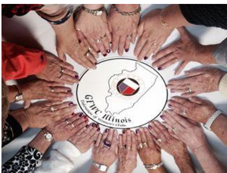
Southern Region meeting attendees women painted one nail purple and "Put A Nail In It" for Domestic Violence Awareness.