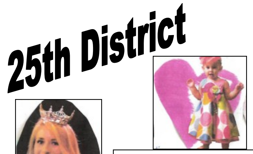
One of many winners at the Town & Country Days, sponsored by Eldorado Woman's Club.