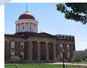
Old State Capitol