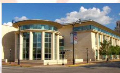
Abraham Lincoln Presidential Library & Museum