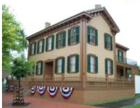
Lincoln Home National Historic Site