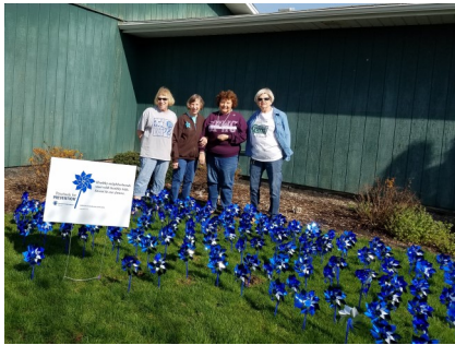
Glenwood Junior Woman's Club planted a pinwheel garden