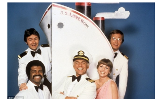
The Love Boat aired from 1977 -1987.