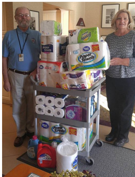
GFWC IL Cyber Stars prepared breakfast for the guests at Fisher House, and Nancy's Bluebirds brought paper and cleaning products for the House.