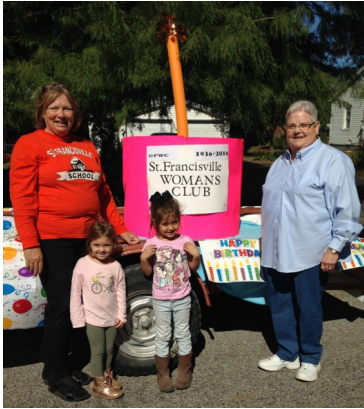
The St. Francisville Woman's Club, District 23, entered this float in the Chestnut Parade, in celebration of their 80th anniversary.