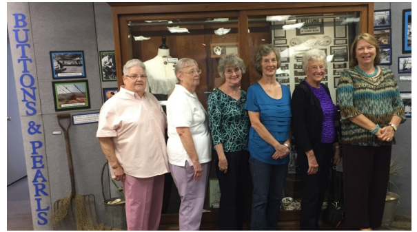
The members of St. Francisville Woman's Club visited the Lawrence County Historical Society Exhibit following their donation to help with expense of the "Buttons & Pearls" exhibit. St. Francisville is located on the Wabash River and once had a button factory. All of this was part of the Smithsonian Traveling Waterways Exhibit. Only 6 communities in Illinois were selected to do this.