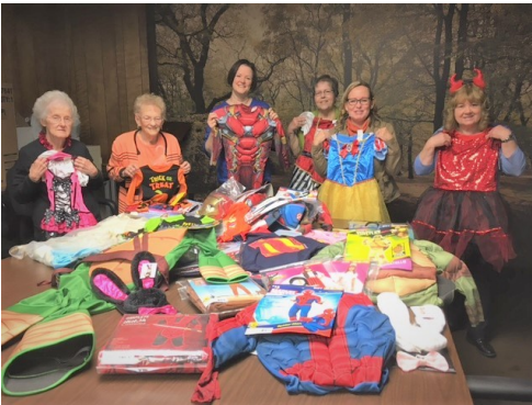
14/15 District collected costumes to send to St Jude's Children's Research Hospital.