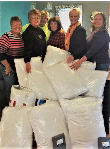
GFWC Abingdon Junior Woman's Club, District 14/15, donated pillows to their local shelter providing them with a good night's sleep.